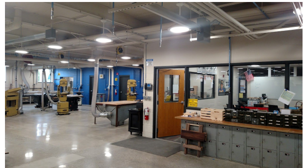
South Campus- New manufacturing & design